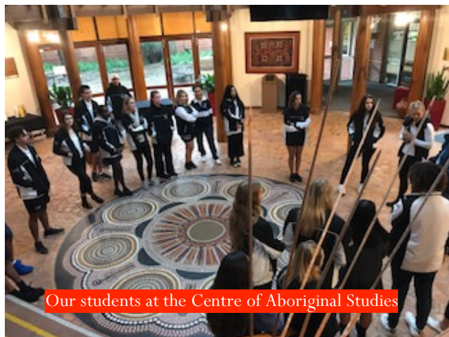
Our students at the Centre of Aboriginal Studies